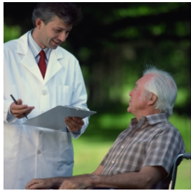
Long-term care is not just provided in nursing homes--in fact, the most common type of long-term care is home-based care.